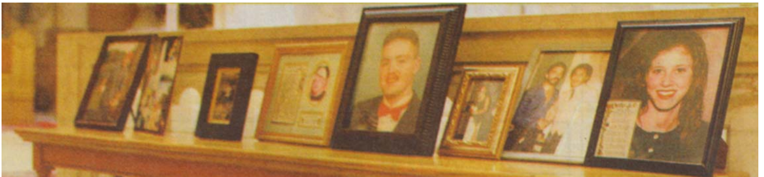
Photos of loved ones lost to the effects of drugs and alcohol line tables at the front of St. Anne's Church during the memorial service.